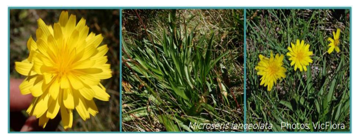
Microseris lanceolata is now used to define the variety that is confined to alpine and sub-alpine herb fields of the eastern ranges. Flowering usually occurs during summer. The roots are fleshy but not tuberous, cylindrical to long tapered.