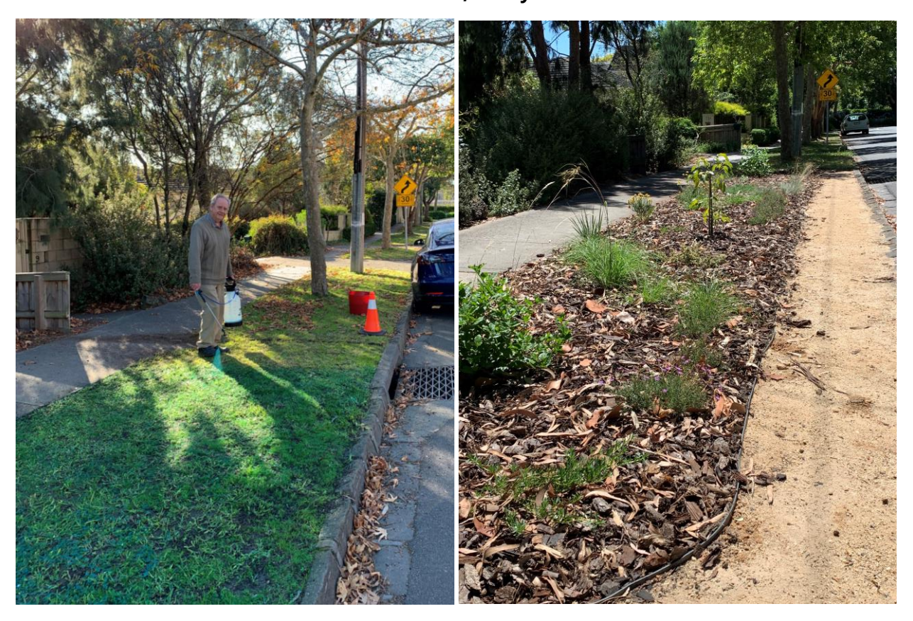
Chatham Rd, Surrey Hills