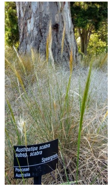
Rough spear grass

The sign in the photo above is an excerpt from 'Remnant' by indigenous poet Ryan Prehn.