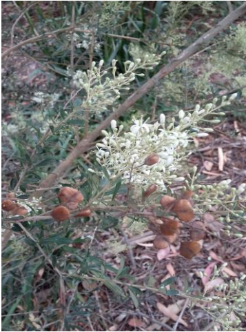
Bursaria spinoza (Sweet bursaria)