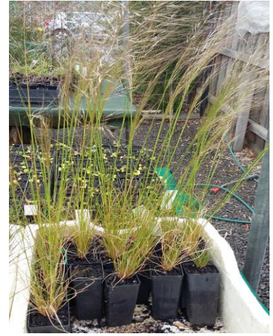
Austrostipa scabra (Rough spear grass)