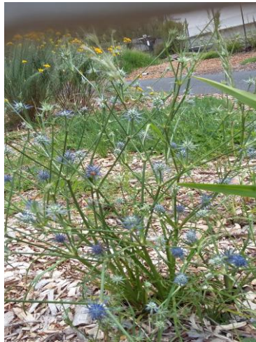
Eryngium ovinum (Blue Devil)