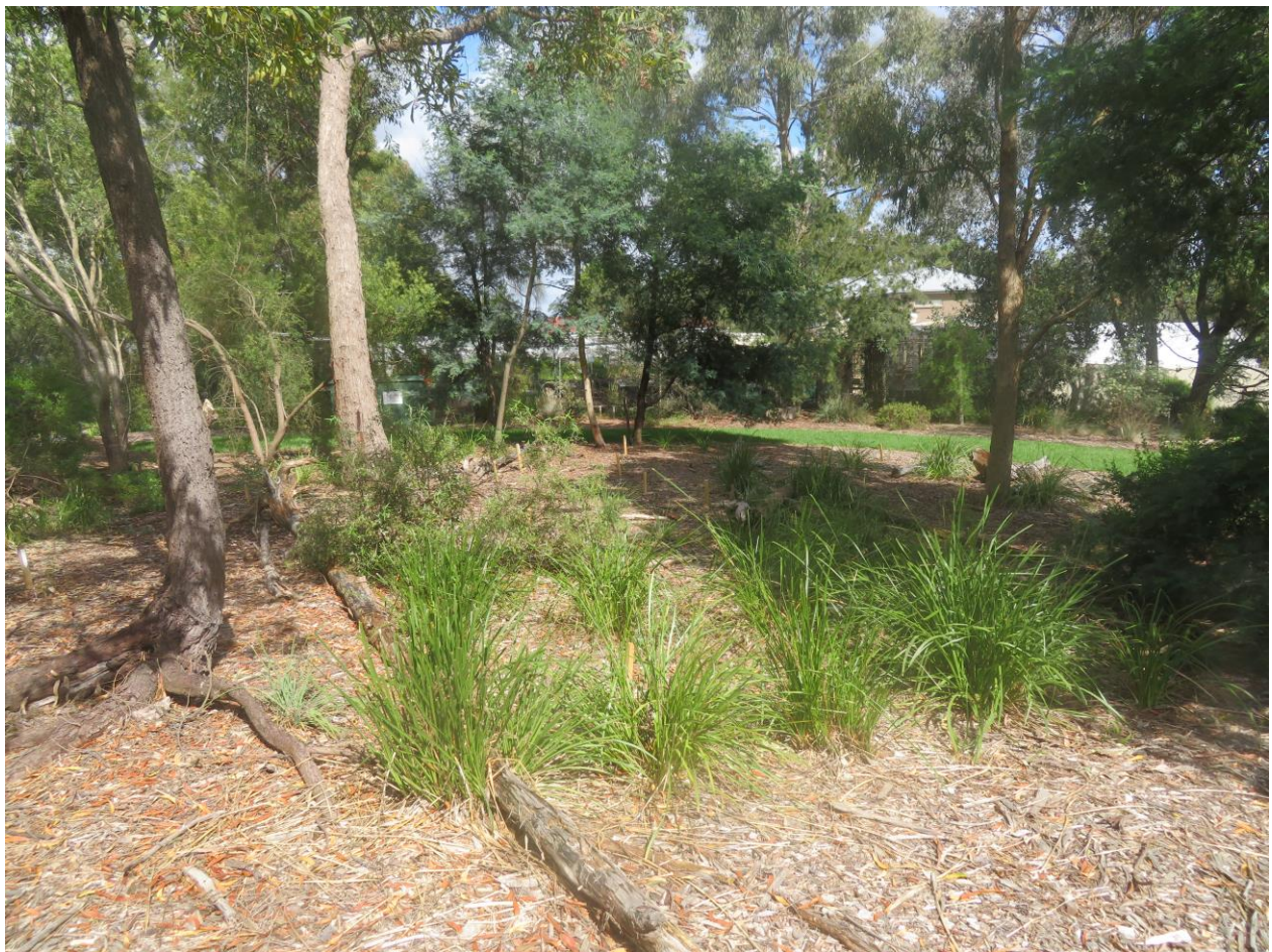
A view of a section of the new display bed east of the nursery which we will plant out in autumn.