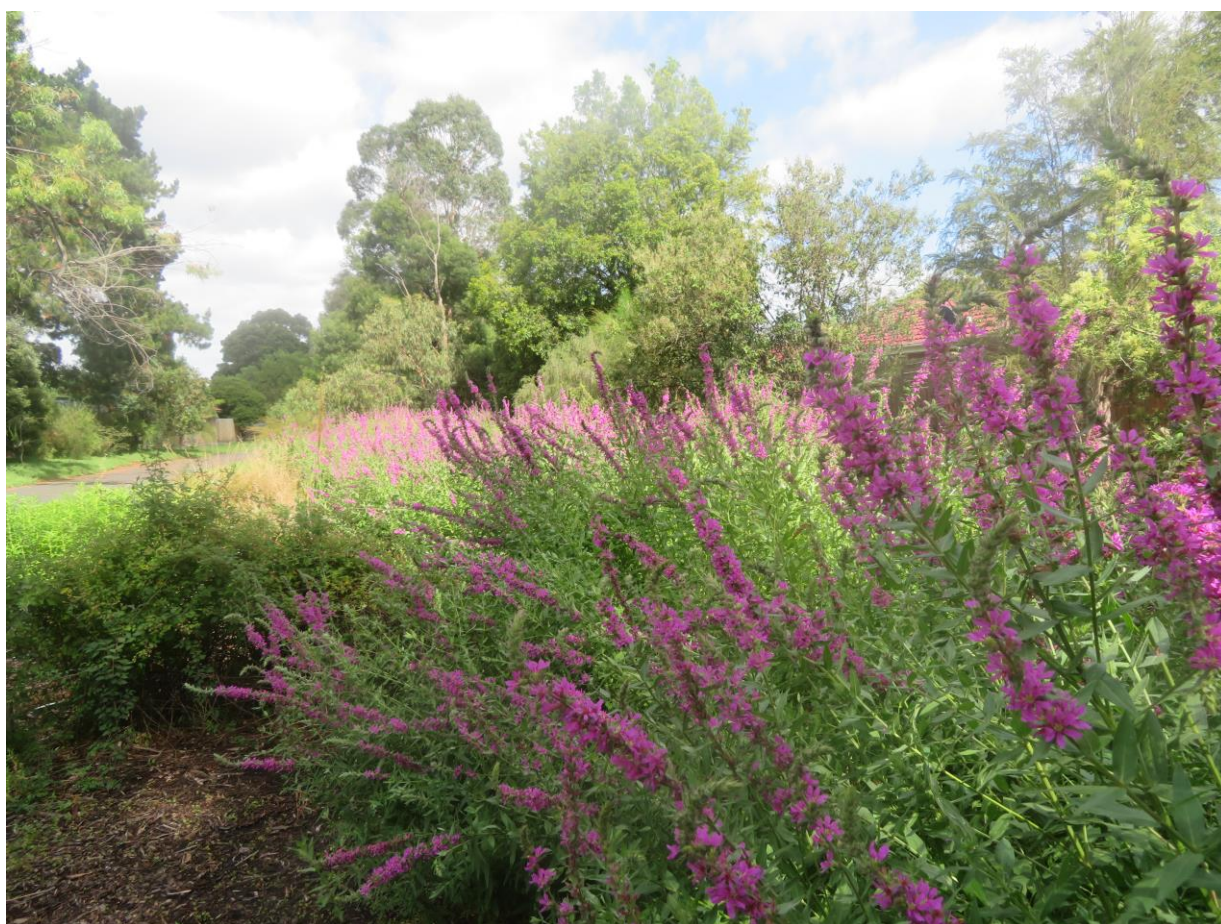
Lythrum flowering spectacularly in Bushy Creek in December 2017 after plentiful rain