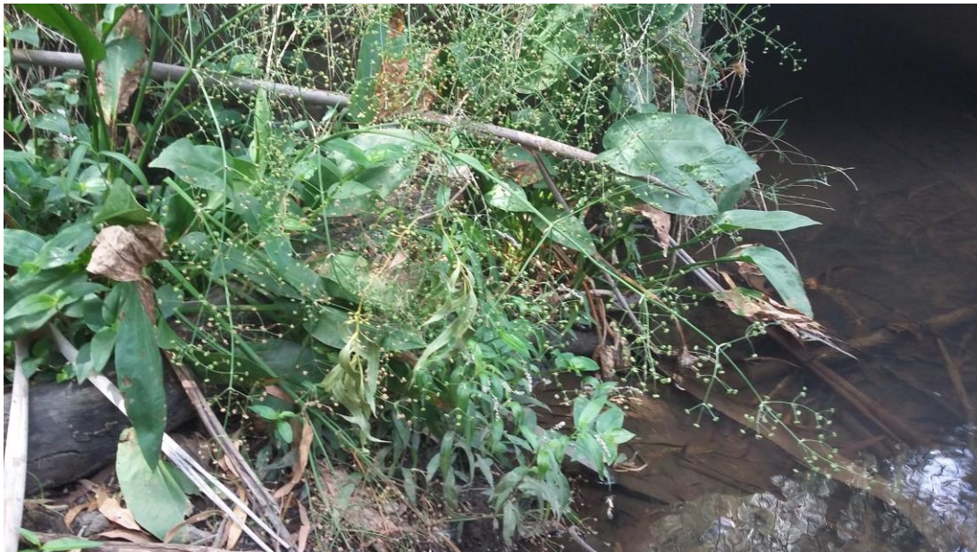
Alisma plantago-aquatica (Water Plantain)

An easily grown attractive plant for bog gardens and shallow ponds. I discovered this specimen growing alongside Olinda Creek in Mt. Evelyn this dry March. This perennial herb produces a long flower bract with dainty flowers which develop into small berries. Leaves and fruit are eaten by animals. It will die back to a tuberous rhizome in winter.