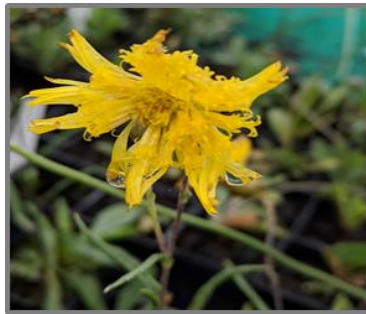
Podolepsis jaceoides – Showy Podolepsis The thick taproot was baked before eating