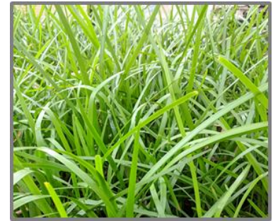
Lomandra longifolia – Spiny Headed Matt-rush Base of stem can be stripped and eaten raw.