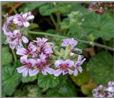
Geranium sp. – Native Geranium These plants have woody tap roots rich in starch which were probably beaten before being cooked.