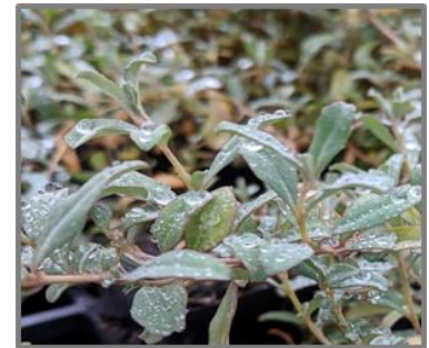
Atriplex semibaccata Leaves edible after boiling. Berries eaten raw.