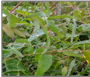
Eucalyptus Viminalis – Manna Gum Flowers soaked in water to make a sweet drink