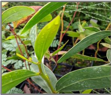
Acacia pycnantha – Golden Wattle Roasted seeds and gum were eaten, bark used as medicine

We have had quite a few customers looking for plants which they can grow as bush tucker in their gardens. There are also teachers in schools and kindergardens who are keen to educate children on edible bush plants and on the traditional uses of plants by indigenous people. In response to this demand Gabrielle Bradley has produced a booklet on bush foods. Look out for this booklet which we aim to publish soon! In the meantime we have included some excerpts below.